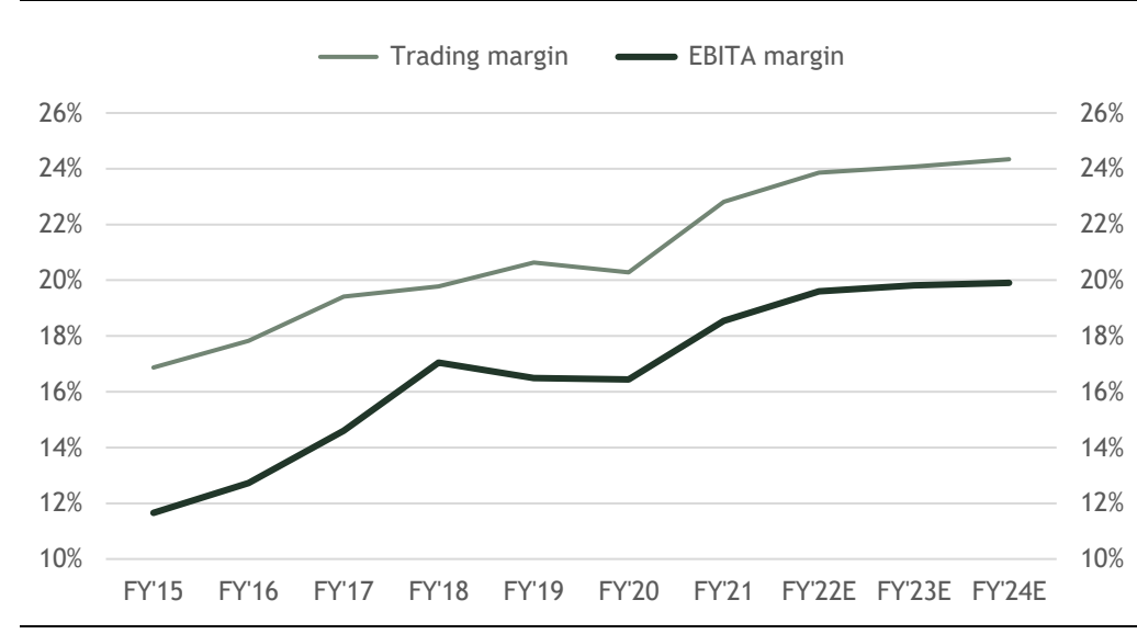
Figure 2: Group pre and post central overhead EBITA margins, FY15 to FY24E